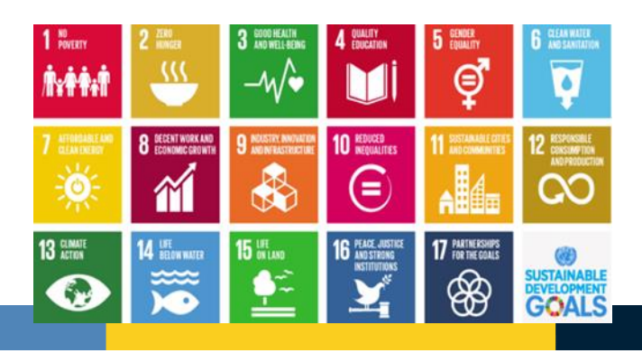
THE NPM NEWSLETTER Produced by UNSOM Police

Mogadishu – On 04 March, the MoIS and UNSOM co-chaired the Joint Police Programme Executive Board, which brought together ministries responsible for policing and police representatives from the FGS, Puntland, Galmudug, South-West State and HirShabelle. A total value of USD 2.2 million of support activities were approved by the board. The board also took the strategic decision on broadening the pool of implementing partners while until now UNOPS and UNDP were the only implementing agencies. It was also agreed to meet separately for a discussion of salary payments by the respective Ministries of Finance in relation to stipend payments. The three donors - EU, UK and Germany - announced the opening of a funding stream for the establishment of Federal and State Darwish units while the EU announced an initial pledge of USD 5M.