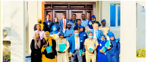
WSD trainees display their training certificates

IESG assisted Sweden's Folke Bernadotte Academy (FBA) with the Women's Situation Desk (WSD) staff training held between 14-20 September in Mogadishu. Travel and accommodation arrangements were made by FBA. Responses were very positive with all FMSs participating in the training. Each WSD team included 50% women participants. A key aspect of the training was that each WSD team will develop plans to engage with their local communities and organizations to suit their particular environments.