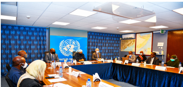
Mogadishu: Deputy Secretary-General Amina J. Mohammed, accompanied by the SRSG and other senior UN staff, met with the FEIT, EDRC and SEITs Chairpersons on 12 September 2021.

The Federal Elections Implementation Team (FEIT) issued an updated electoral timetable on 4 September which indicated 18 September as the date for the conclusion of the UH elections.