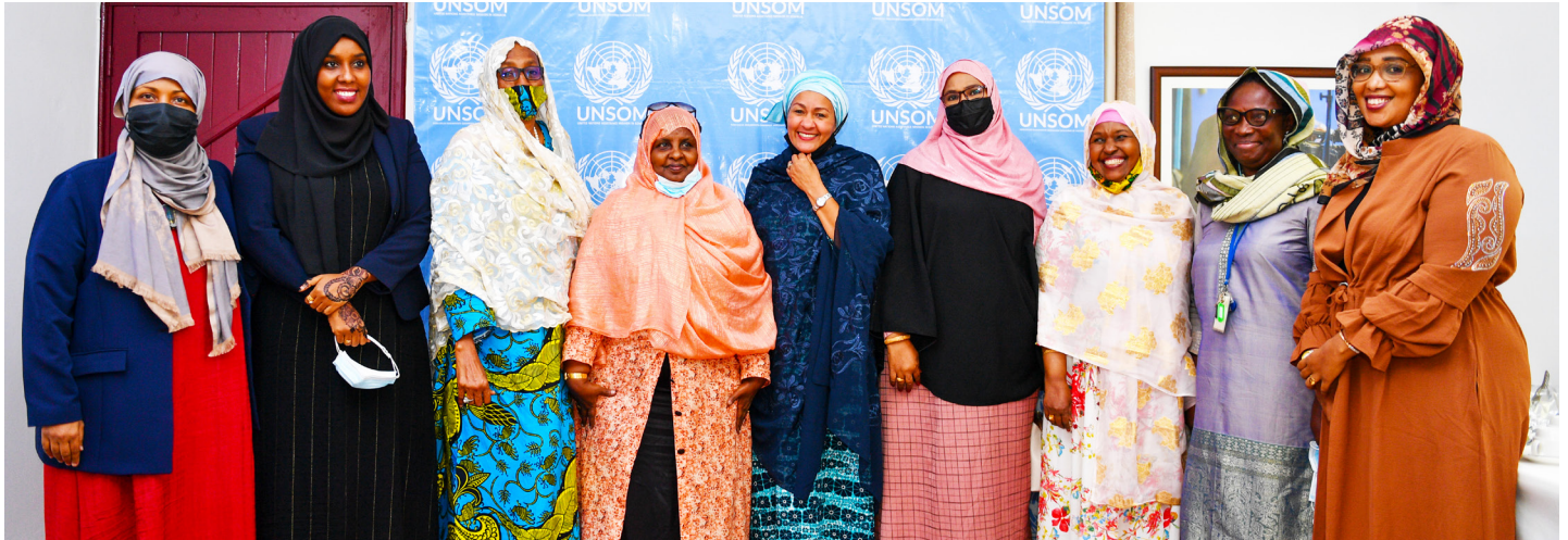
UN Deputy Secretary-General Amina J. Mohammed poses for a group photo with Somali women leaders after a meeting in Mogadishu, Somalia, on 12 September 2021