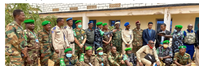
Joint AMISOM and Somali Police Force assessment team in Baraawe

On 22 August, IESG Field Office facilitated a briefing session on the indirect election in Somalia to AMISOM Formed Police Units (FPU) Police Officers. 22 participants attended the session in Beletweyne. IESG funded the translation of AMISOM Police shared elections security training material for use by Somali Police trainers, which has been circulated. The second National Elections Security Committee (NESC) meeting is scheduled to be held on 2 October.