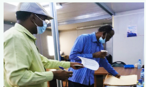
FEIT Operations staff preparing training materials

FEIT will cascade the training to the SEITs to ensure staff are adequately prepared for the HoP elections. About 200 polling staff will be involved in the registration of 27,775 electoral delegates and will facilitate their right to cast their vote for a candidate of their choice. The delegates will receive a briefing on casting a ballot before the polling for the electoral seat begins.