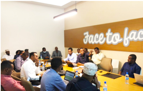
Training on LoA Management, procurement and Payment process on 30 August in Mogadishu

The trainings aimed to enhance OPM and election committees understanding of the financial and procurement processes (requirements, rules and regulations, as well as supporting documents), and strengthen participants' capacities in