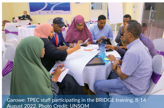
Garowe: TPEC staff participating in the BRIDGE training, 8-14 August 2022.

TPEC Chairperson and Commissioners, TPEC Regional Chairpersons and the Secretariat staff participated in two Building Resources in Democracy, Governance and Elections (BRIDGE) workshops in Garowe between 8-14 August on Voter Registrations (35 participants) and Strategic Planning for Electoral Administration (37 participants).