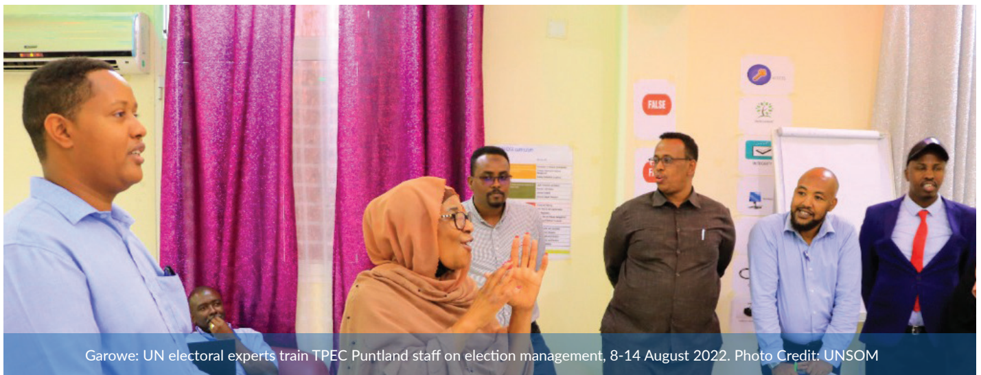
Garowe: UN electoral experts train TPEC Puntland staff on election management, 8-14 August 2022.

TPEC Chairperson and Commissioners, TPEC Regional Chairpersons and the Secretariat staff participated in two Building Resources in Democracy, Governance and Elections (BRIDGE) workshops in Garowe between 8-14 August on Voter Registrations (35 participants) and Strategic Planning for Electoral Administration (37 participants).