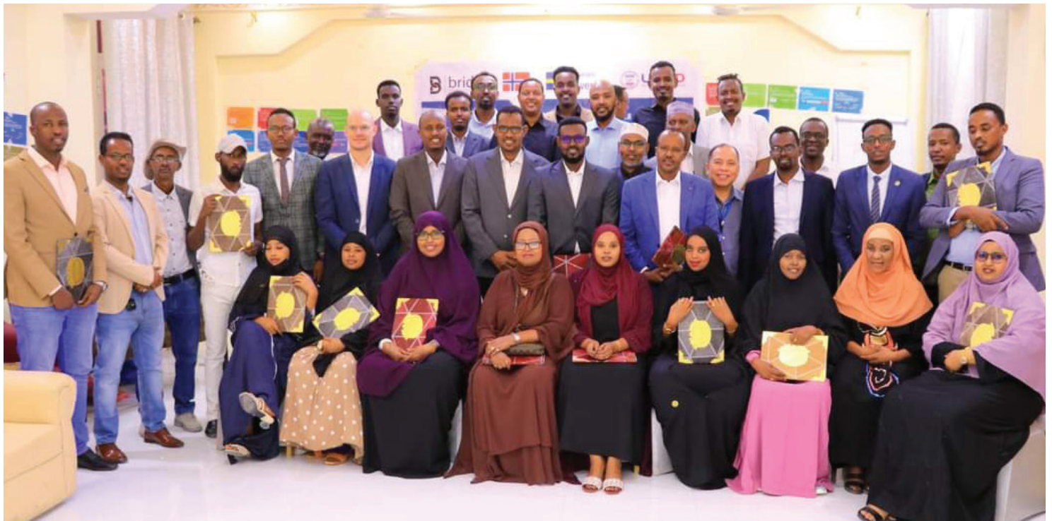
Garowe: UN electoral experts and TPEC Puntland staff during a training session on election management, 8-14 August 2022.

In South-West State, the Hudur local council indirect elections concluded on 4 September with the selection of 27 members, including five women. On 10 September, the District Council elected the District Commissioner and two Deputy Commissioners, one of whom is a woman.