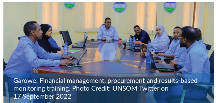
Garowe: Financial management, procurement and results-based monitoring training.

TPEC staff from different departments interacted with the team. They worked jointly on developing Terms of Reference (ToRs), procurement documentation, financial templates, ToRs for staff recruitment, and technical specifications for equipment and supplies. The TPEC staff and IESG/UNDP team also worked closely on developing the operational budget for the Puntland electoral process for July 2022 – June 2023. A set of coordination meetings were organized to prepare for the meetings with donors for resource mobilisation.