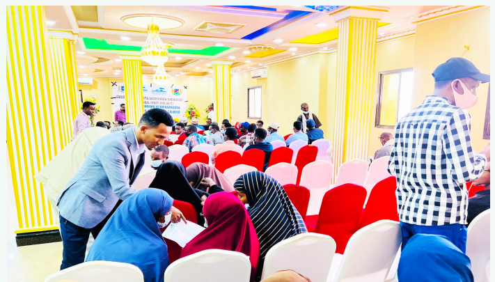
Delegate training on 16 January in Baidoa

The FEIT member responsible for international stakeholder engagement met with the IESG External Relations Advisor on 6 December and discussed FEIT plans to hold thematic information meetings regularly for the remaining electoral period with the various partners including donors, national and international stakeholders, and ambassadors of various countries. The FEIT member noted the first thematic meeting would be on the 30% women's quota.