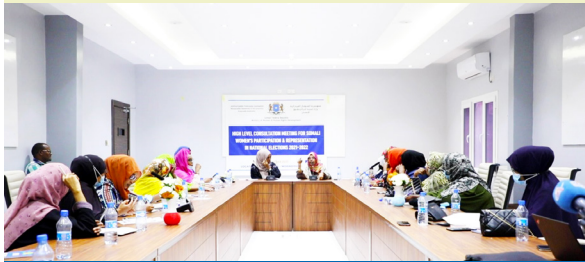
High level consultative meeting on women's participation 2 December 2021.

On 1-2 December in Mogadishu, the Federal Ministry of Women and Human Rights Development (MoWHRD) held a high-level consultative forum on realizing women's 30% quota in the HoP elections. The forum undertook a thorough analysis of the work, achievements and challenges of women leaders, Women Ministries at the FMSs level and the Goodwill Ambassadors (GWA) to achieve the 30% quota in the Upper House (UH) elections. It also took stock of strategies that worked and those that did not work and outlined actions with the most potential to be effective for the advocacy campaign during the HoP elections. Participants included FGS and FMSs representatives, CSO activists, leaders, GWA, MPs and Senators elect. The Forum was supported by the UN Gender and Elections Task Team.