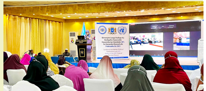
Mogadishu, GwAs conference.

Between 27-28 December, GwAs held a conference on Women's Political Participation and 30% women's Quota in the 2021 Federal Election Process in Mogadishu. The two-day conference was attended by approximately 150 people including Somali Women Ministers at both federal and FMS levels, civil society, human rights activists, and women aspirants. After the conference, the GwAs issued a communique encouraging stakeholders to fulfil commitments towards the 30% quota. UNSOM Strategic Communications and Public Affairs Group (SCPAG) provided communication support for the GWA conference.