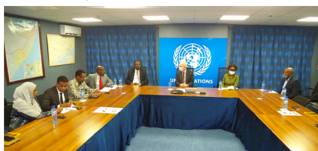
SRSO meeting with the new FEIT chairperson and international partners on 25 January.