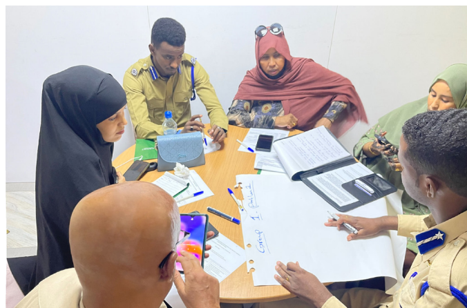
Participants in the election security lessons learned workshop. 14 June 2022.