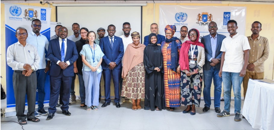
Electoral Dispute Resolution Mechanism lessons learned workshop, Mogadishu.