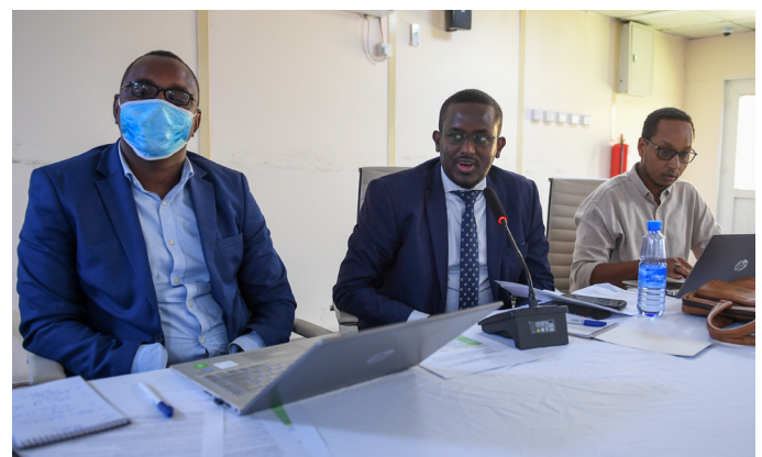
EDRM lessons learned Workshop Participants, 18 June 2022.