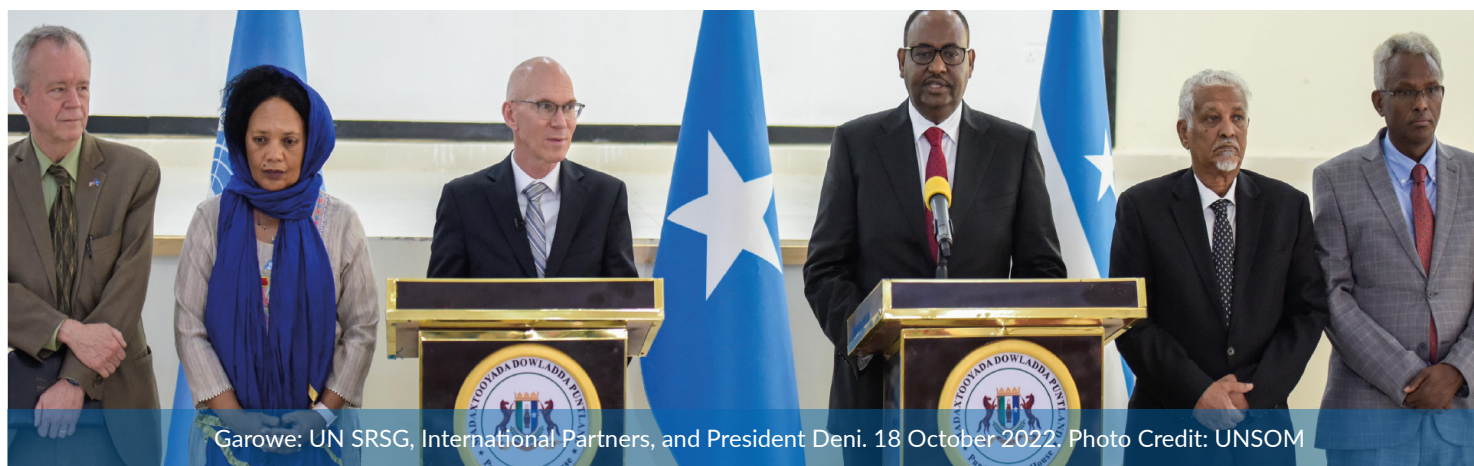
Garowe: UN SRSG, International Partners, and President Deni. 18 October 2022.

(VRC) and polling station. For some district areas, TPEC did not list VRCs and polling stations due to local and internal disputes. The Puntland Ministry of Interior, Federal Affairs and Democratization (MOIFAD) is trying to resolve these issues so the districts can partake in the elections.