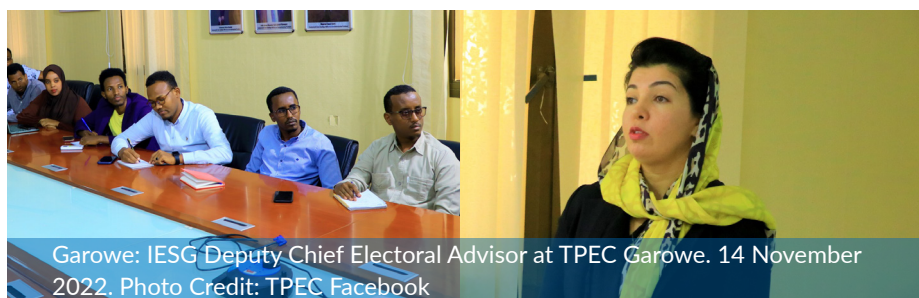
Garowe: IESG Deputy Chief Electoral Advisor at TPEC Garowe. 14 November 2022.