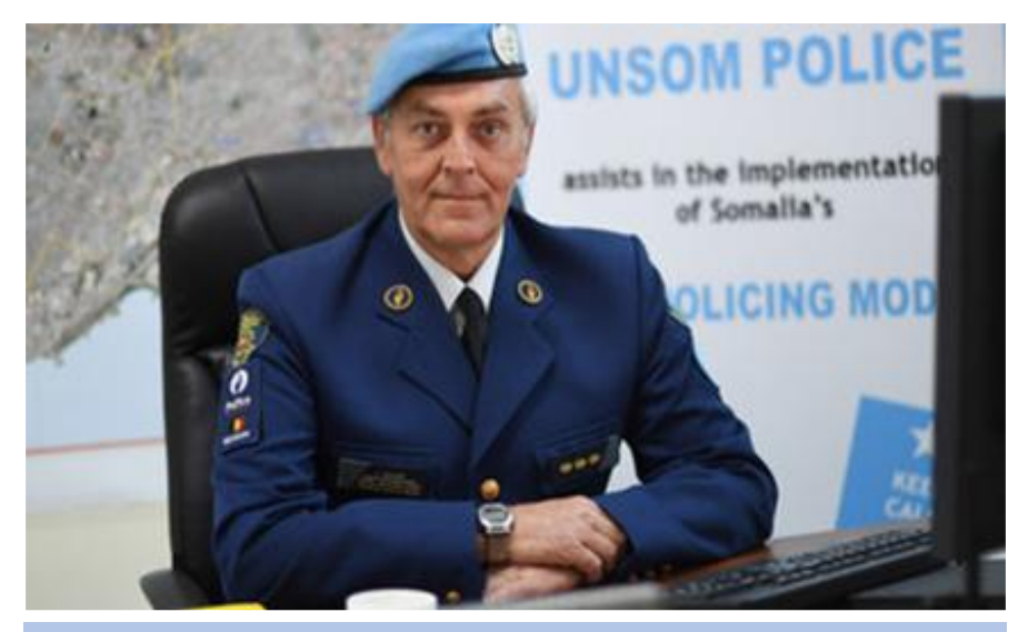
Farewell Commissioner Lucien Vermeir

UNSOM Police meets with SWS Minister of Security