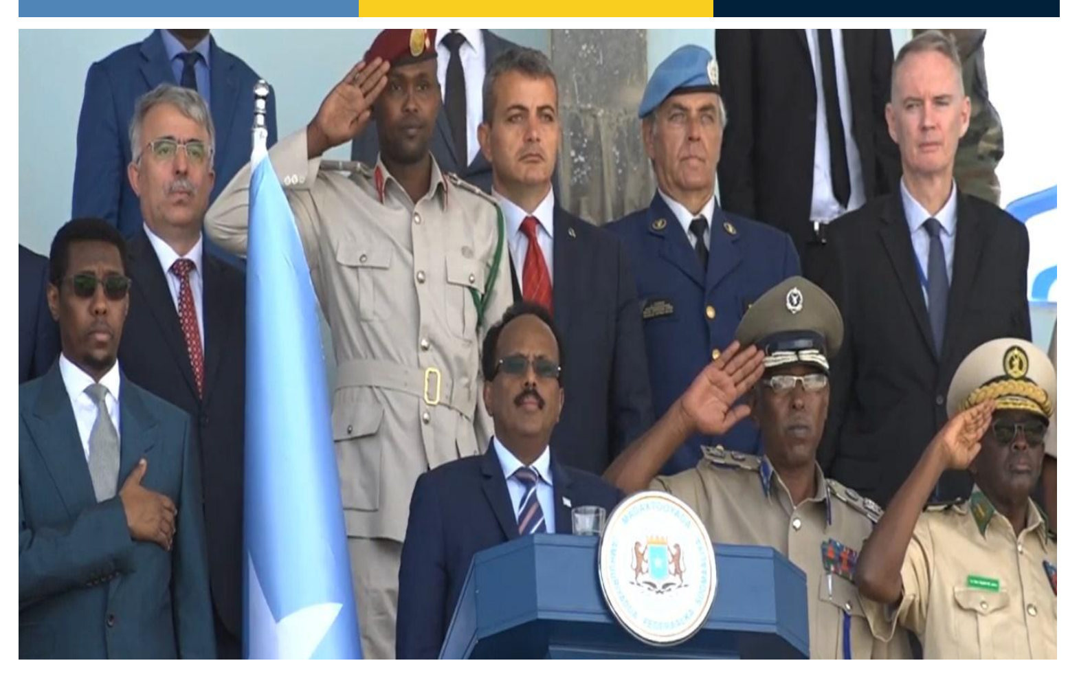
UNSOM Police Commissioner Lucien Vermeir with the Somali president, Mohamed Abdullahi Farmajo, of Somali Police Force Commissioner Bashir Abdi Mohamed, of Minister of Internal Security Abukar Hassan Islow "Duale" and other prominent guests during the celebration of the 75<sup>th</sup> Anniversary of the Somali Police Force.