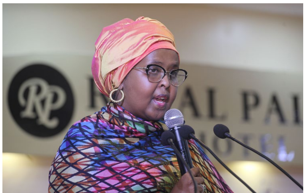
FGS Minister of Women and Human Rights Development Deqa Yassin

"UNSOM supported Somali women's struggle for equal political representation," she said. "The struggle to that end is still ongoing."